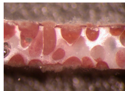
Cross section, with biofilm